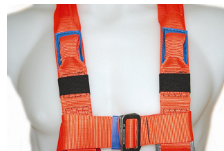
1150 Ergo - Loop Option